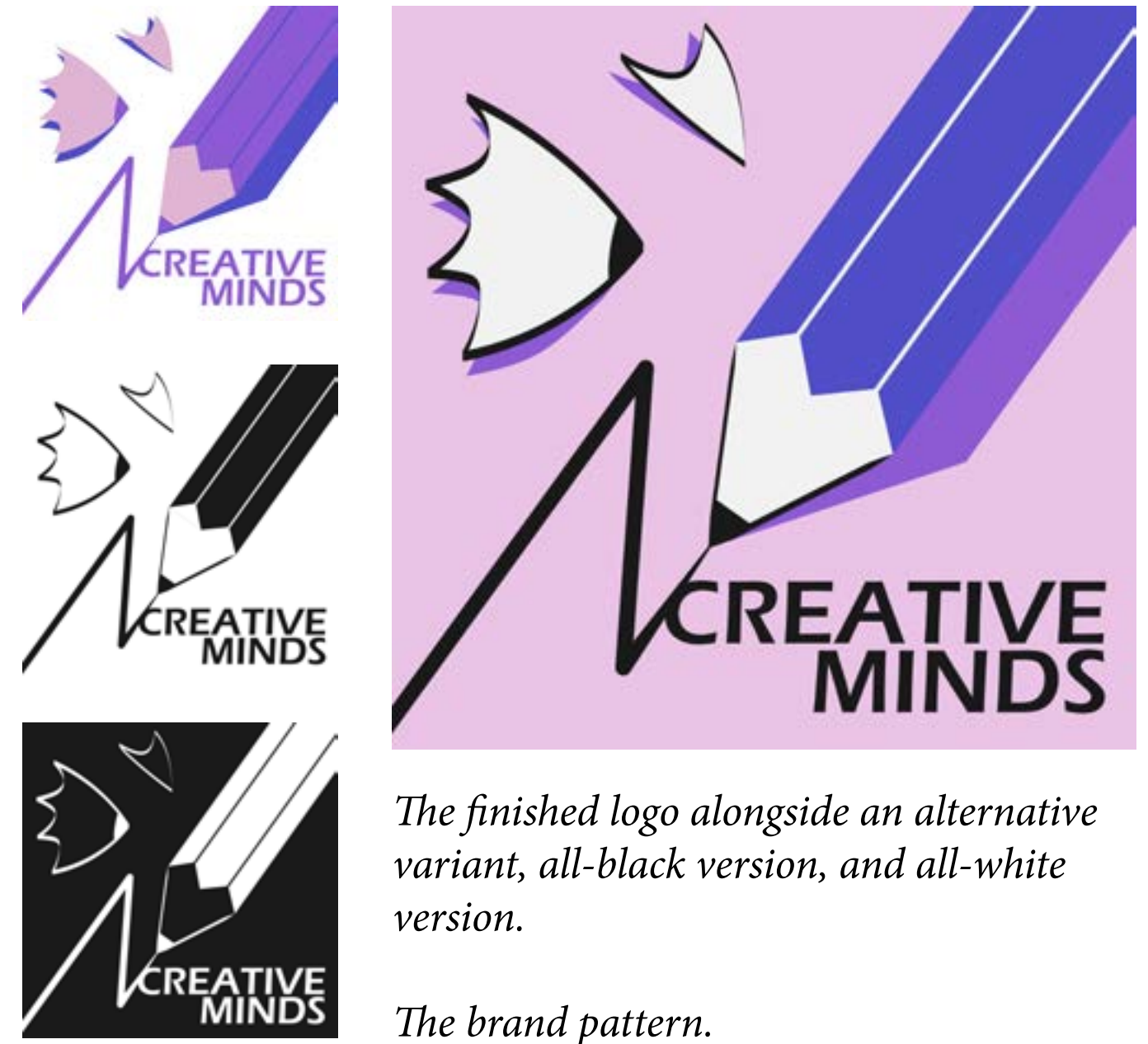
The finished logo alongside an alternative variant, all-black version, and all-white version.

The typography choices were made to be blunt with a bit of creative flare, as well as to complement one another as primary and secondary typefaces.